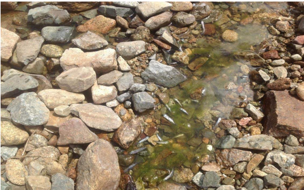
Dead Baby Salmon, Drought Victims