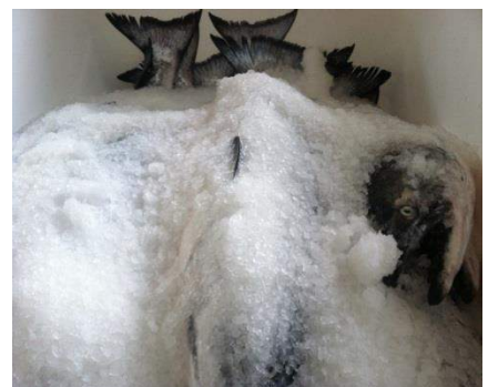
Commercially Caught Salmon In 2015 Chillin'

If we lose a second year of natural spawned salmon, what will that mean? A near normal number of hatchery salmon will offset the losses but will that be good enough for season-setting fishing managers? We don't know but fear is afoot in salmon communities as people ponder an uncertain future.