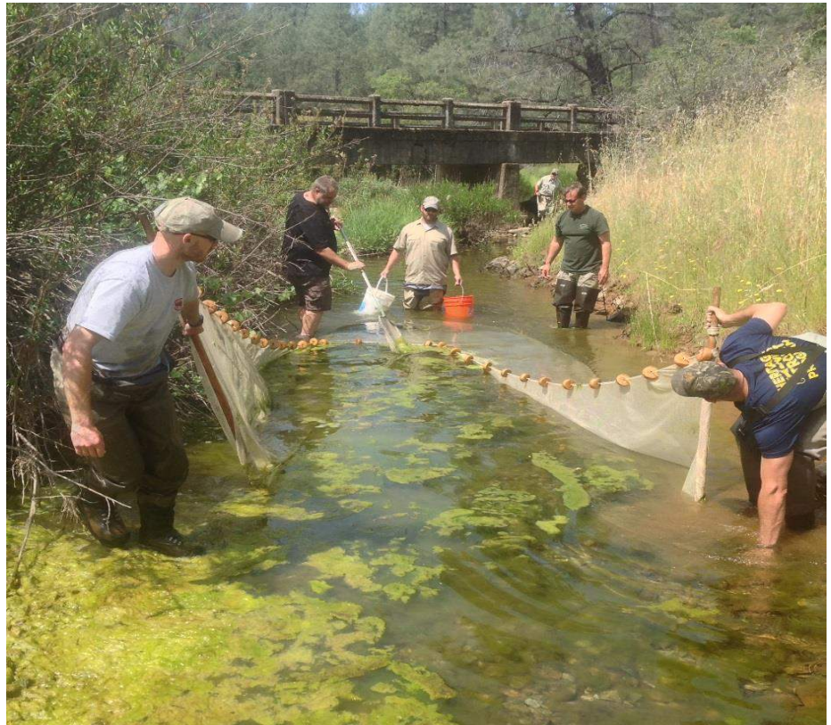
Trapping Baby Salmon In A Drought-stressed Creek