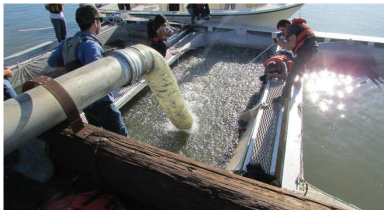
Baby Hatchery Salmon Released After Being Trucked To Delta Due To GGSA Efforts

In some places in Oregon and Washington, where dams lacking fish ladders block salmon streams, adult salmon are trapped, trucked upstream of the dams, and released to spawn in headwaters. Later, juvenile salmon are trapped in these headwaters, trucked back downstream of the dams, and released. It's an expensive way to do business but this approach is being discussed for some California dams including Shasta and dams on the upper Yuba River. With the drought boring into natural spawning salmon runs, we may see this effort accelerated. On the other hand, since the federal government is the lead and moves slowly, don't hold your breath.