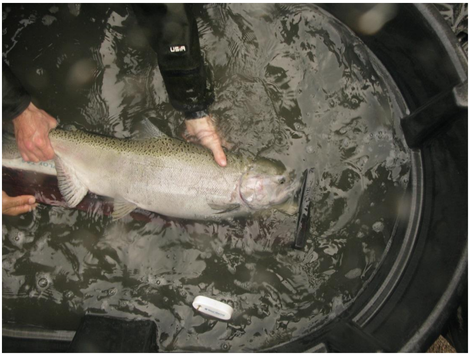
Winter run salmon taken for captive breeding

Due to the drought, state and federal hatchery managers once again trapped and bred as many winter run salmon as they could this More irreplaceable genetics vear. from the small population of winter run salmon would have otherwise likely been lost due to hot river In 2014, instead of conditions. producing the customary 200,000 baby salmon, they produced over 600,000. This year's egg take looks like it will produce only about 400,000. GGSA applauds these efforts at the Livingston Stone Fish Hatchery located at the base of Shasta Dam.