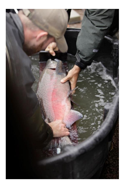
State CDFW rescue adult salmon from Yolo Bypass ag drainage canal in 2014

rebuilding plan in 2013. Since completion of the project, state officials are promising they'll next fix a bigger related problem of adult salmon getting lost and killed in a neighboring ag drainage to the south in the Yolo bypass, just west of Sacramento. This is believed to be the major entry way 600 winter run traveled in 2013, resulting in their failure to spawn that year. Caltrout has been working with local rice growers and state officials for years to design a fix there. GGSA will continue to lend support to fixing this problem. Hopefully a new address momentum to the relatively easy structural solution has emerged in the wake of the rebuilding of the Knights Landing Outfall Gates.