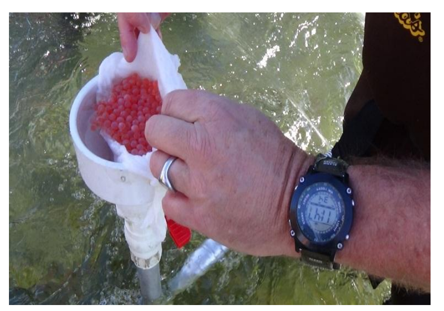
Precious cargo. Five hundred fertilized salmon eggs ready to go into the gravel.